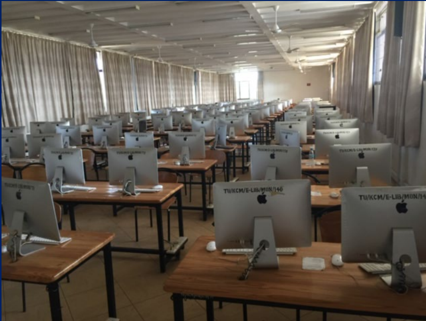
KCMC Medical School