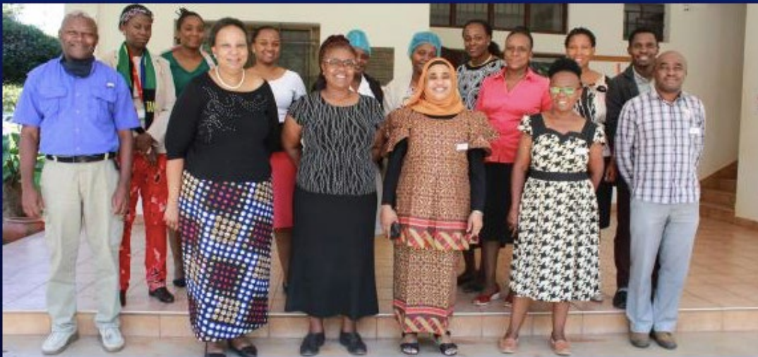
Group photo for HighRif-C Study Training held on 29th and 30th June 2020

KCMC can work with KCRI on cardiac research.